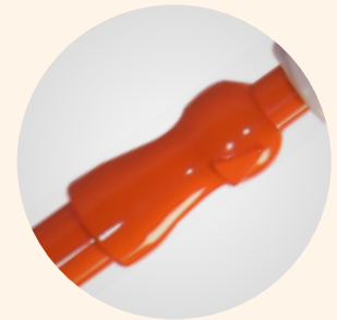
Orientation arrow on hub