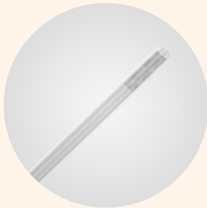
Soft inner catheter with fused echogenic band

Stylet for Pro Embryo Trans / Pro Echo Trans / Twinkle Pro Embryo Trans Catheter