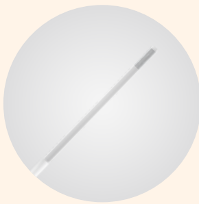
Fused echogenic Band