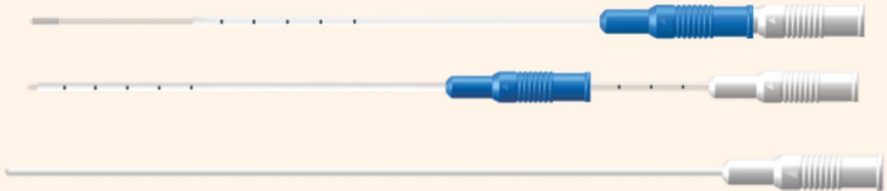
Stylet for Embryo Trans / Echo Trans / Twinkle Embryo Trans Catheter

The TWINKLE EMBRYO TRANS Embryo Transfer Catheter is used to introduce in-vitro fertilized (IVF) embryos into the uterine cavity.