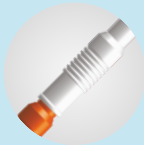
Integrally molded hub