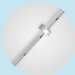
Silicone depth positioner