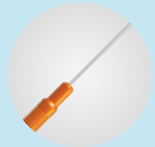
With malleable stylet